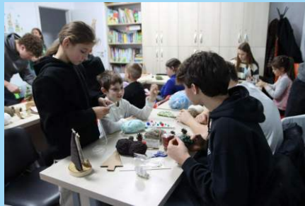
AIS Vienna volunteers, together with the Little Inocenti in Bistrita