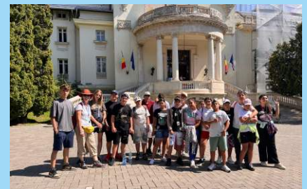
Inocenti children from Bucharest and Ilfov County, on a mountain camp