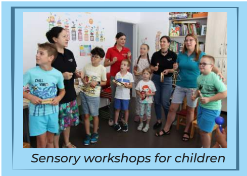
Sensory workshops for children

In the summer, the Inocenti Foundation in Bistrita carried out the project “Workshops for Children with Disabilities,” funded by the local budget of the municipality of Bistrita. The activities included sensory workshops adapted to the children's needs and a recreational trip, contributing to the emotional, social, and sensory development of the beneficiaries.