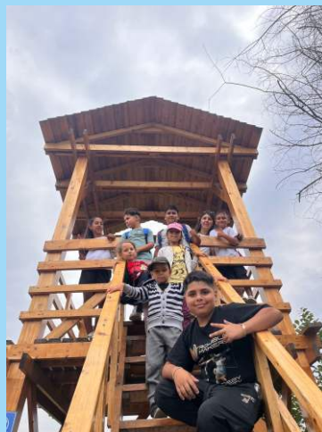
Inocenti children exploring Bucharest's "urban delta"