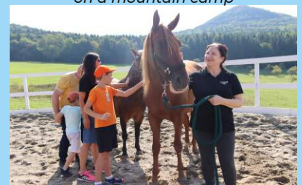
A day at Deac Farm