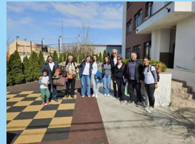
American School of Paris, in Bucharest