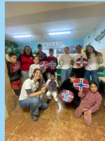
Students from the University of Stavanger, Norway, in the programs in Ilfov County