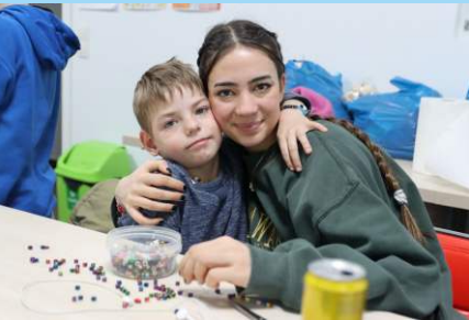
TASIS Group in the programs in Bistrita

The Inocenti Foundation has benefited from the strengthening of valuable international partnerships with a long tradition, which bring an important added value to our programs in Bistrita, Bucharest, and Ilfov County. In Bistrita, volunteer students from TASIS and AIS Vienna have been actively involved in supporting vulnerable children and families. In Bucharest, the long-standing partnership with the American School of Paris (ASP) continues to support the foundation's activities, and starting in 2025, a new partnership with the University of Stavanger in Norway contributes to the development of programs in Bucharest and Ilfov County through the involvement of volunteer students.