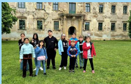
Children from the Day Center in Bistrita visited Bánffy Castle in Bontida